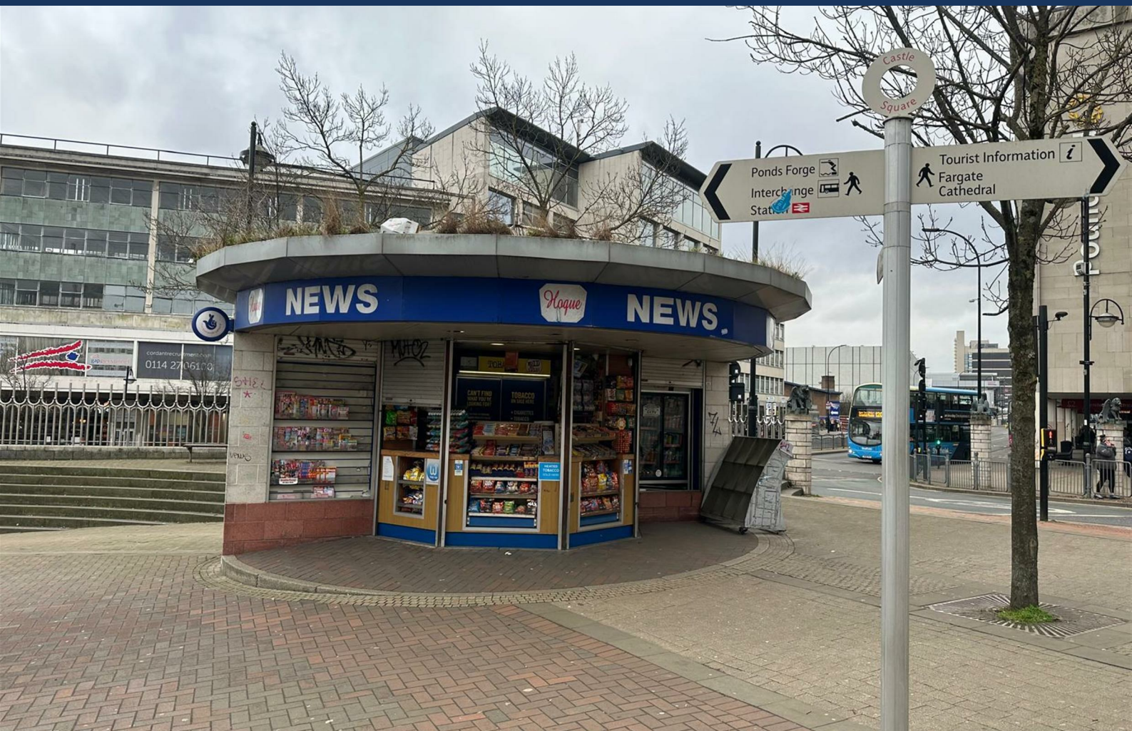
The Kiosk, Castle Square, City Centre, Sheffield S1 2GF

Investment for sale - Offers in excess of £120,000 + VAT Annual rent received of £13,000 + VAT